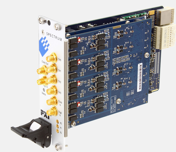
The M4x.4451-x4 PXIe digitizer offers 4 channels with 14 bit resolution and 500 MS/s

Gisela Hassler, Spectrum's CEO, added, "Research institutions and universities run projects and experiments that can take years so they have to know that they can rely on every part to work perfectly for the lifetime of the experiment. Spectrum products are built to last for years as can be seen by these cards still