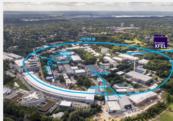
Accelerator ring and experiments at DESY

"Spectrum's products have certainly proven themselves to be reliable, " said Mark Lomperski, Staff Scientist at DESY. "The first digitizer cards that we bought for our group more than 15 years ago are still in use today, happily sampling away. These Spectrum MI.3132s are used to measure the power in the RF pulses in the Linac-2 accelerator, which has 12 RF stations each producing 5 microsecond RF pulses of 20 MW at 50 Hz and the cards sample at 25 MHz. The digital-inputs of the MI.3132s provide an elegant method to 'tag' each RF pulse with information from the central timing system for use in my detailed analysis. These cards are used to monitor the 'health' of the technical systems, from pulse-to-pulse and over a period of years."